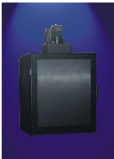
ONYX™ Imaging System

including proprietary software for photon accumulation imaging , in order to create an open platform for development and exploration for the research scientist."