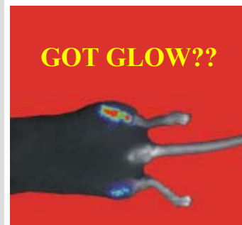
Transgenic mouse (licensed* facility) Imaging time: 1-10 seconds, typical

Real Time Luciferase Imaging* XR/MEGA-10Z™ Enabled Complete System Solution