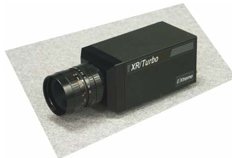
XR/Turbo™ ICCD camera: Strobe-synchronous imaging at 1000 fps

The XR/Turbo™ is available with all intensifier tube options, including the cooled photocathode GaAsP for zero dark count, single photon detection. In response to requests for higher resolution, we recently added a new 1000 fps mode which provides a 320 by 80 ROI with 2 X 2 binning (33% picture height vs. full image via 6 X 6 binning). This generates an effective pixel size of 40 microns, or 20 microns with optional 1:1 fiber optic coupling.